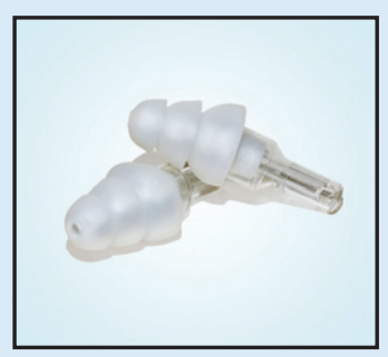
Pre-molded, high-fidelity earplugs