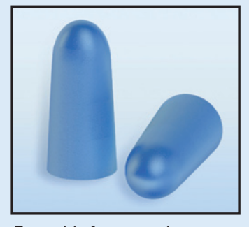
Formable foam earplugs

Wearing earmuffs and earplugs together can further reduce sound, which is great for very noisy environments like woodshops and shooting sports events.